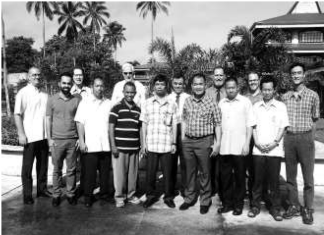
DMiss Students and Some Faculty