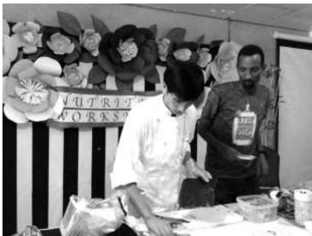
Healthful Recipes Demonstration