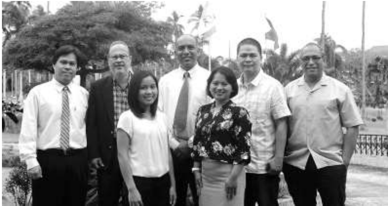
Business Department Faculty and Staff