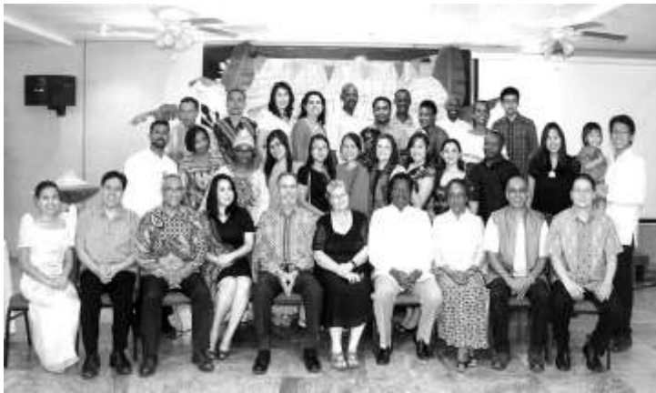
Business Department Gala Night