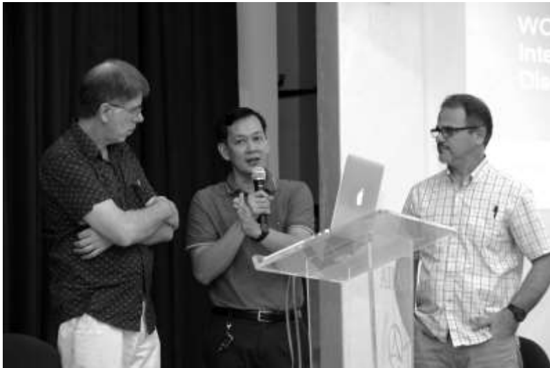
Discussing Important Issues

An exploration of the key expansion and strategies of the church missionary movement from first century to the present. It will emphasize among others the biblical and theological principles of sharing the gospel to the world with a focus in studying and evaluating the different theories, models and strategies in doing mission.