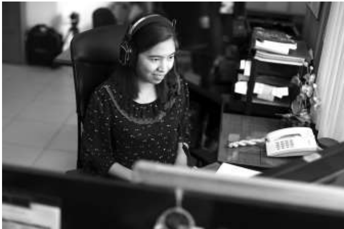
Online Learning Center at Your Service

For further information, including new programs, schedules for courses, admission requirements and academic matters visit AIIAS Online at www.online.aiias.edu (e-mail: online@aiias.edu ).