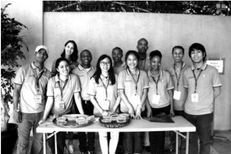
Some of the Graduate School Students

A required culminating activity for all doctoral degree students. It consists of original, primary research that makes a unique contribution to knowledge in the selected area of study. Only an S/U grade is earned. Continuous registration is required until the completion of the dissertation . Prerequisite: BUAD/EDAD/EDCI 897, candidacy status or approval of the department. See Departmental Guidelines for details.