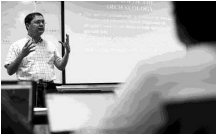
Teaching in the Classroom

MTh program Credits accrued at AIIAS are fully transferable toward a PhD in Religion at AIIAS, conditional to meeting the PhD program requirements, and the MTh degree not being awarded.