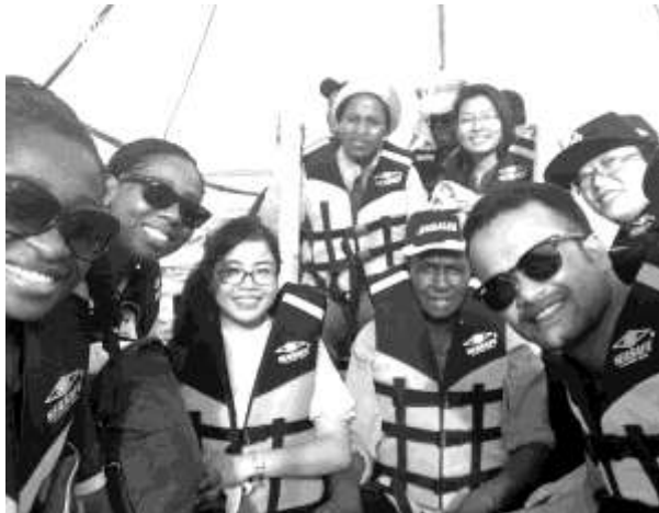
MPH Environmental Health Class on Disaster Management Training

The MPH Handbook, which gives further guidelines, is available in the Department and on the AIIAS web page (under Public Health Department). The handbook contains general information about the Public Health Department and gives guidelines for choosing and writing a thesis, choosing and taking the comprehensive exam, and fulfilling the Field Learning Internship.