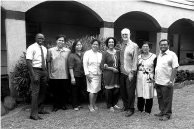
Education Department Faculty and Staff