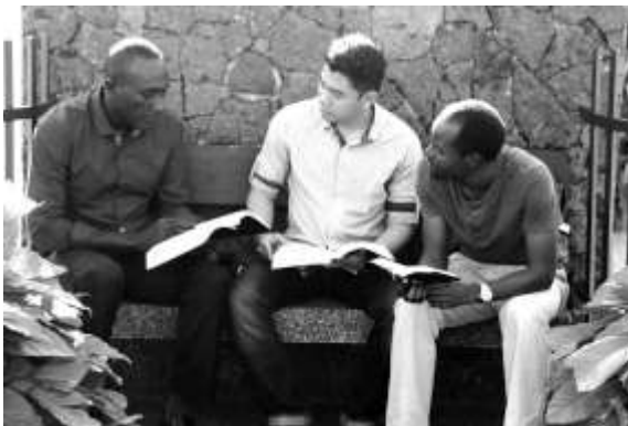
Studying the Word of God

The In-Ministry DMin students should finish the program within 10 years.