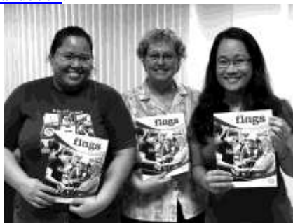
Magazine for Alumni

For detailed information on student services, please refer to the Student Handbook available from the Student Services Office or online at aiias.edu/studenthandbook .