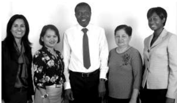
Public Health Faculty and Staff