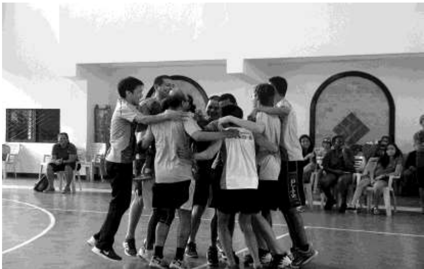
Work Together as a Team

This course is designed to cover current issues and developments in financial accounting. The topics covered depend on the current issues in the field of financial accounting. It is designed to familiarize students with current issues and problems facing the accounting profession, to examine in depth various solutions proposed by accounting scholars and others, and to strengthen students' understanding of today's critical issues in accounting theory. Graduate registration involves a study of advanced issues in accounting. Pre-requisite: Financial Accounting II .