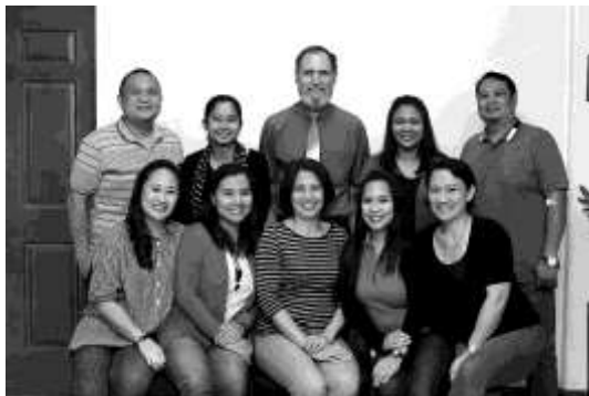
Admissions and Records, Academic, and Student Services Departments

A student who does not meet regular admission criteria or does not wish to receive graduate credit may be allowed to register on a non-credit enrollment basis. This status is also available to students who have not provided documentation showing eligibility for graduate work. A student who submits pertinent documents before the end of the semester may earn credits for his/her coursework that semester (provided all course requirements have been completed) and his/her status will be reevaluated.