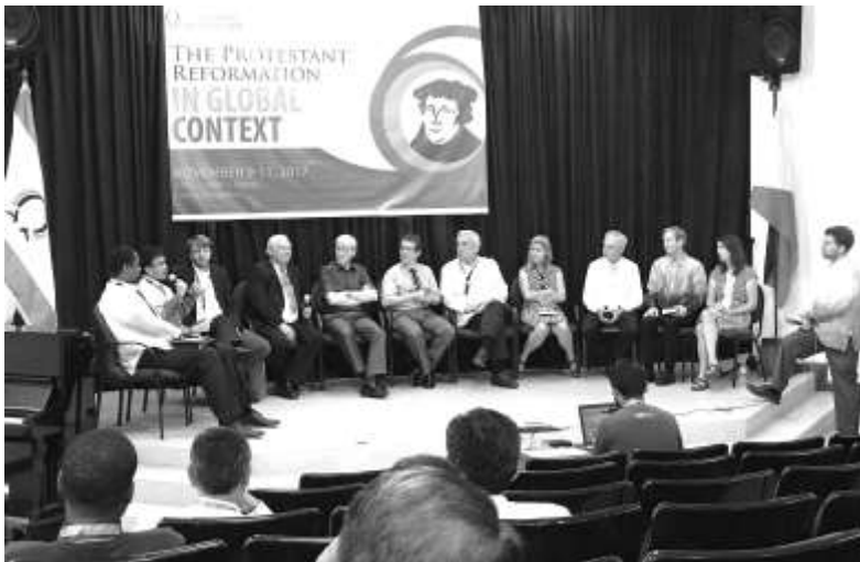
20 th AIIAS Annual Theological Forum

Based on the student's ministerial experience the requirements for the Practicum course may differ.